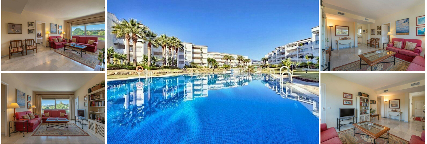
Playa Rocio beachfront urbanisation in Puerto Banus area

Location, Convenience, and Lifestyle! Stunning 3-Bedroom Beachside Flat with Garage and Storage. Nestled within the enchanting beachside urbanization of Playa Rocio, this captivating 3-bedroom, 2-bathroom flat offers an unparalleled coastal living experience.