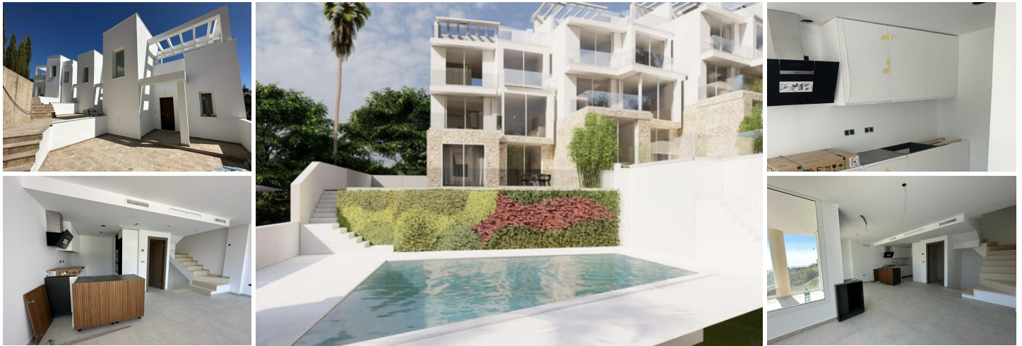
Townhouse AERA - Sea and mountain views in Torreblanca

Great opportunity, 10 minutes from the beach! In a complex of 4 properties, we offer this charming terraced house offering extraordinary views.