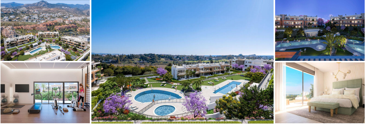
ELEONOR middle floor apartment - South facing and New construction - Estepona / Atalaya

The apartment is ideally located in the Atalaya area in Estepona, close from the prestigious Atalaya golf, Atalaya international school, shops and only few minutes away from Puerto Banus.