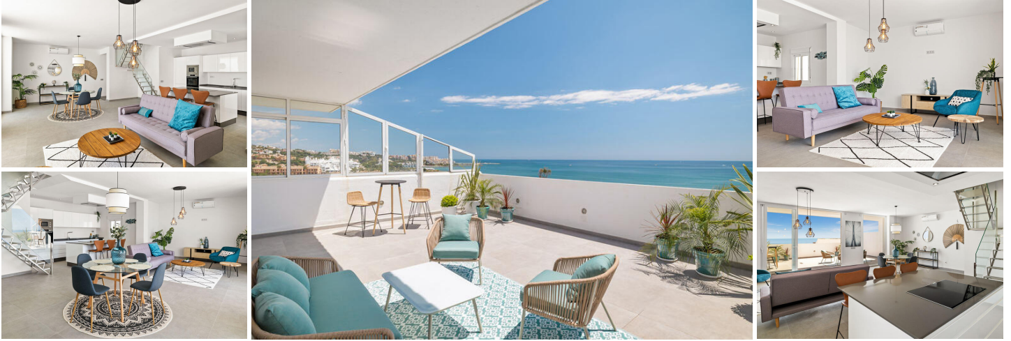
Penthouse Horizonte - Panoramic sea view in 1st line of beach - Estepona

In a private residence with direct access to the beach of Estepona, we present this bright duplex renovated in 2020. Facing south, it consists on the main level of a living room with a fully equipped open kitchen, all with direct access to a large terrace offering spectacular views of the Mediterranean coast with 180° of shades of blue. On the upper level, we discover the master suite with its dressing room and its private bathroom, 2 other bedrooms sharing a 2nd bathroom, and a beautiful glazed terrace to relax.