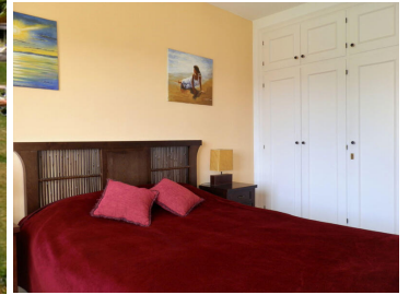
Lovely 2 Bed, 2 Bath Middle Floor Apartment in Hotel Del Golf

Available for winter rental until April. 2022