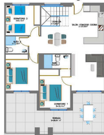
VIVIENDA TIPO C