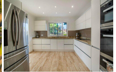
Charming detached villa in Hacienda Las Chapas, Marbella East

Very charming villa in the exclusive and 24-hour secured urbanization of Hacienda Las Chapas, Marbella East.