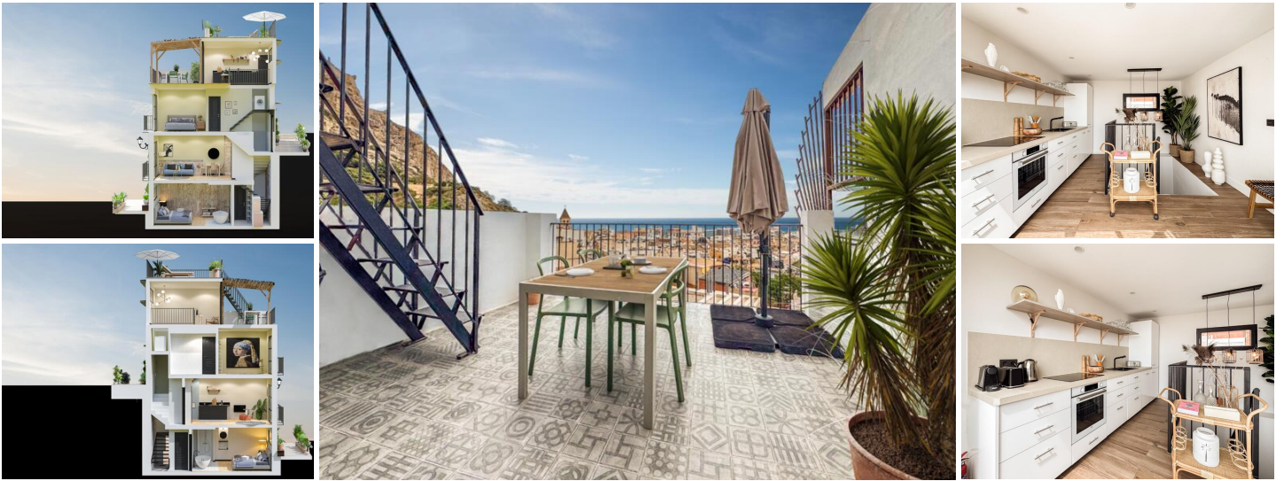
Tourist house with sea views and high rental yield in Alicante Old Town

Located at the highest point of the iconic Santa Cruz neighbourhood, in the heart of Alicante's Old Town, this exclusive detached house enjoys a privileged position with breathtaking panoramic views over the city, Santa Bárbara Castle and the Mediterranean Sea