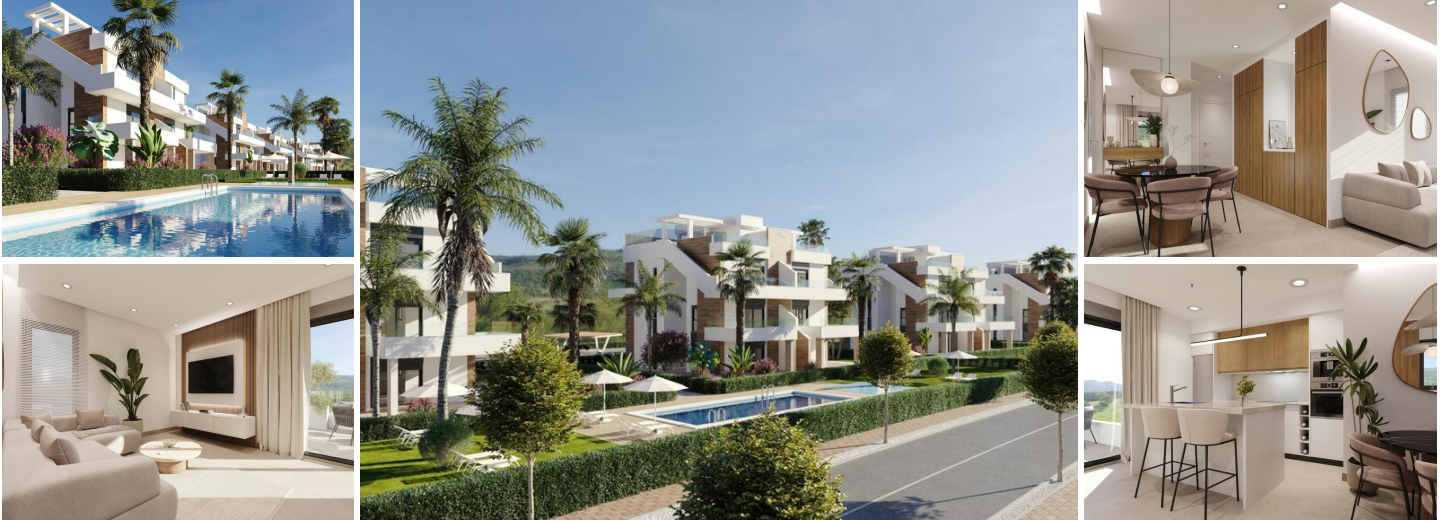
New Build Apartments in Hacienda del Álamo Golf Resort, Murcia