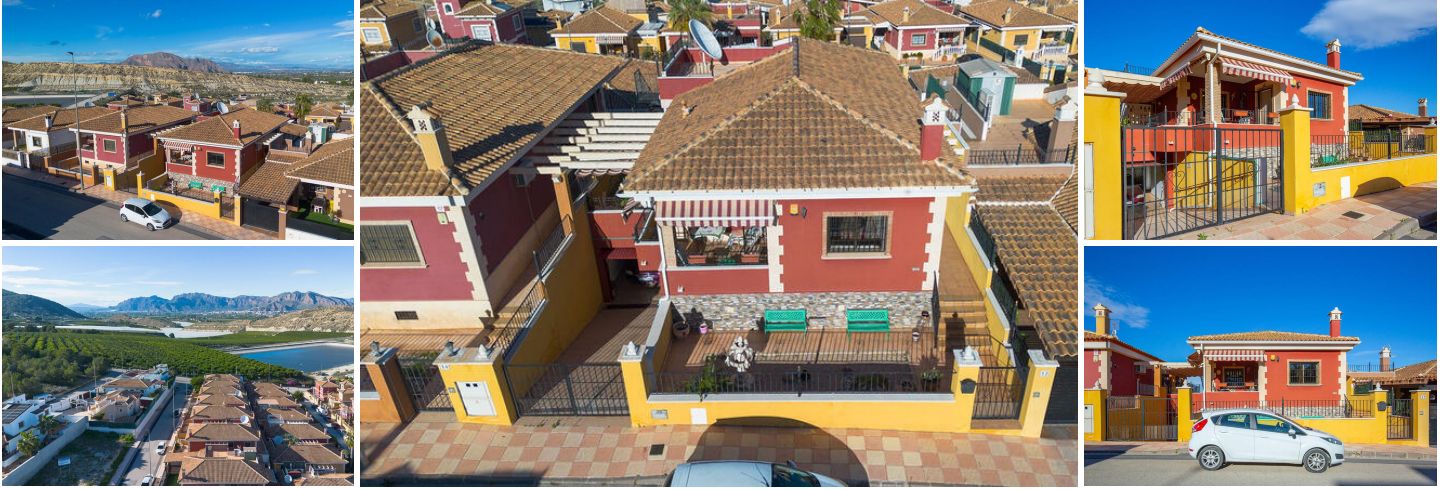
Stunning Detached Villa with Panoramic Valley & Mountain Views – Bigastro

Situated in an elevated and highly desirable position in Bigastro, this beautifully maintained detached villa offers exceptional outdoor space, generous interiors, and truly breathtaking open views across the valley and towards the surrounding mountain range.