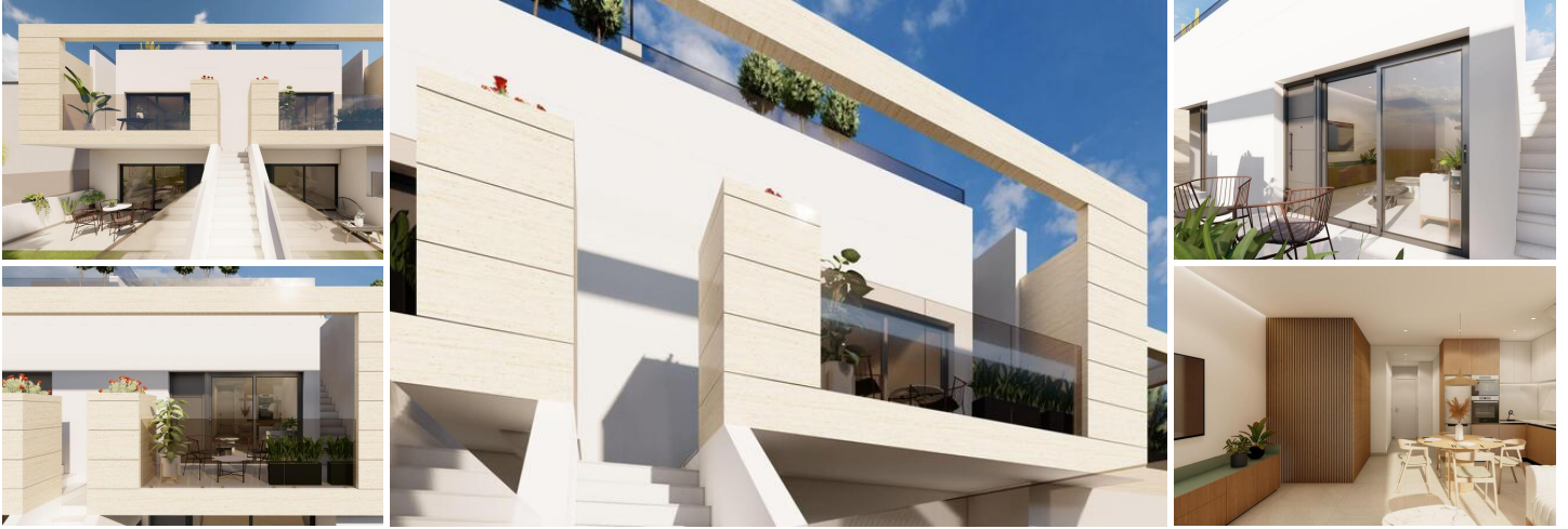
New Build Bungalows in San Pedro del Pinatar Modern Living Near the Beach