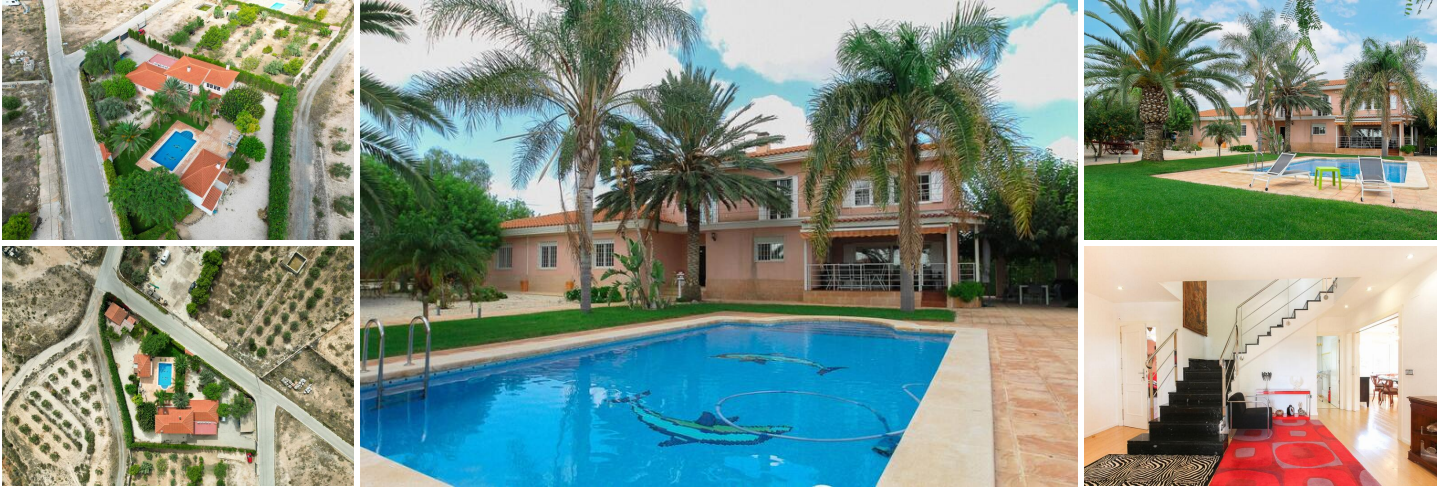
Detached villa with large plot and pool in San Vicente del Raspeig, Alicante

In the municipality of San Vicente del Raspeig, just a few minutes from Alicante, stands this magnificent detached villa, built with high-quality materials and designed for comfort, space, and privacy