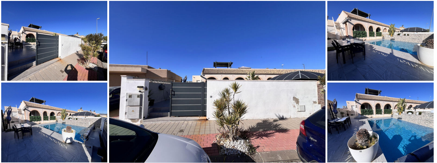
Detached villa with pool – Sought-after area

Discover this charming detached villa offering 3 bedrooms and 1 bathroom, ideal as a primary residence or a holiday home.