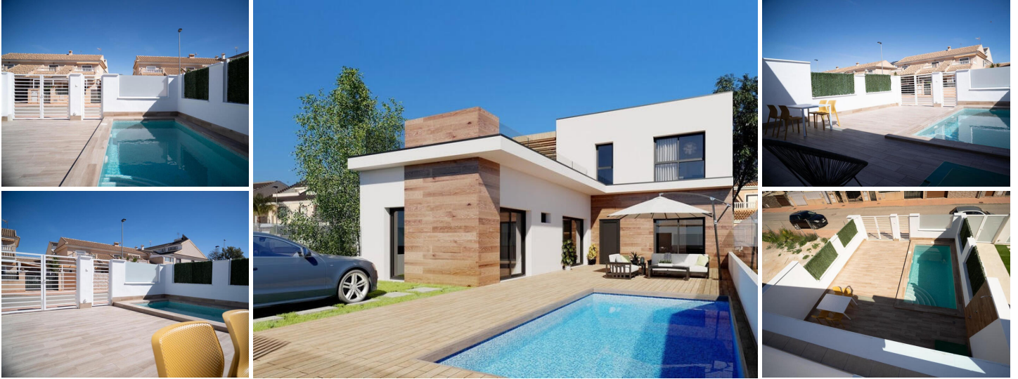
TOWNHOUSE IN SAN JAVIER

luxury complex of 24 one level villas or on 2 floors with private pool, terraced area and solarium with Summer kitchen that allows you to enjoy all hours of sunshine, every day of the year.