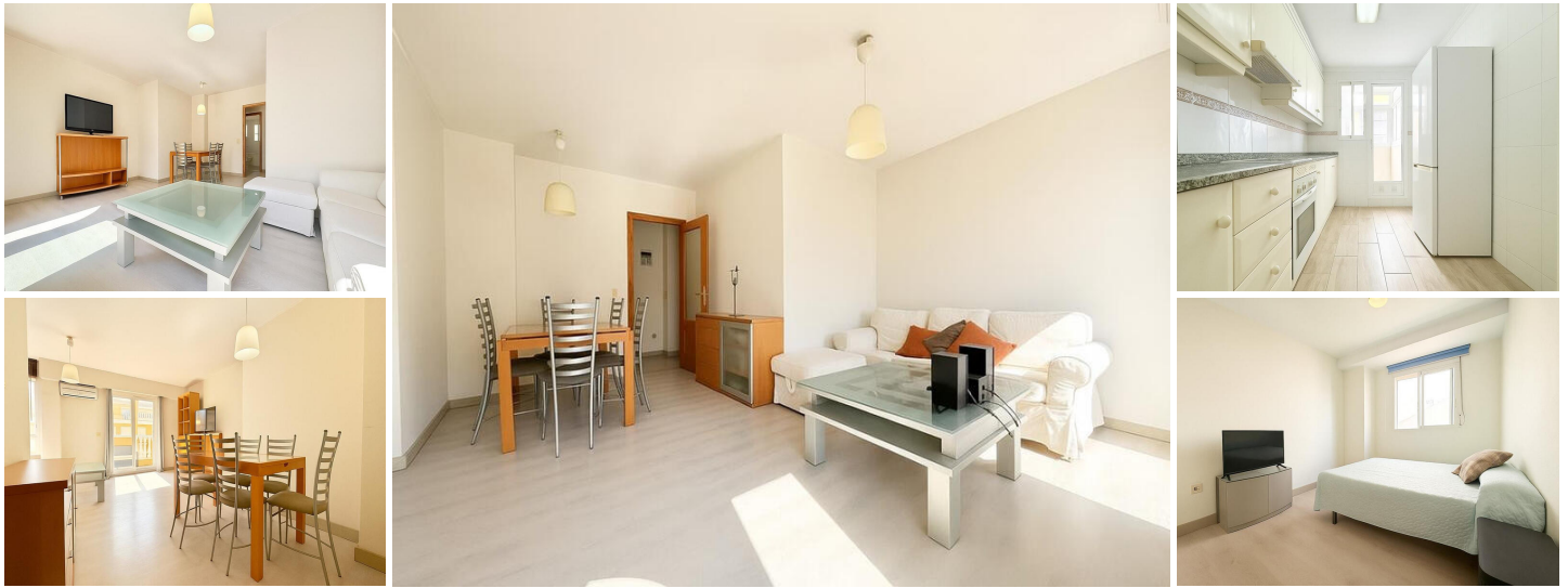
Bright Apartment Close to All Amenities – Dénia Town Centre

Discover this charming apartment ideally located close to all amenities in Dénia, within walking distance of schools, supermarkets, cafés, restaurants, and bus stops, and just a short stroll from the town centre and beaches.