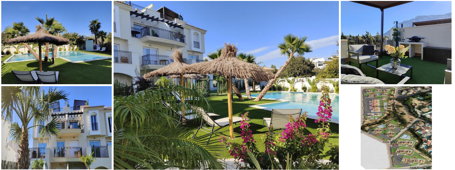
Elegant 2-Bedroom Penthouse with Pool & Private Parking – Dénia

Discover modern Mediterranean living in this beautifully renovated 2-bedroom penthouse, offering bright open spaces, stylish finishes, and panoramic surroundings.