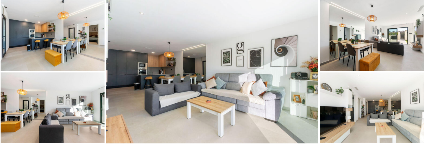
Beautiful Fully Furnished Ground-Floor Apartment in Lo Crispin – Algorfa

This modern ground-floor apartment (built in 2023) offers contemporary comfort in an excellent location within the quiet and well-maintained urbanisation of Lo Crispin, near Algorfa, just a short drive from Torrevieja and Ciudad Quesada.