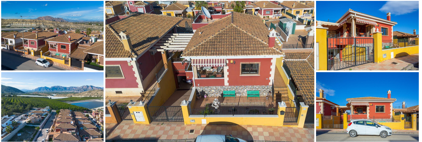
Stunning Detached Villa with Panoramic Valley & Mountain Views – Bigastro

Situated in an elevated and highly desirable position in Bigastro, this beautifully maintained detached villa offers exceptional outdoor space, generous interiors, and truly breathtaking open views across the valley and towards the surrounding mountain range.