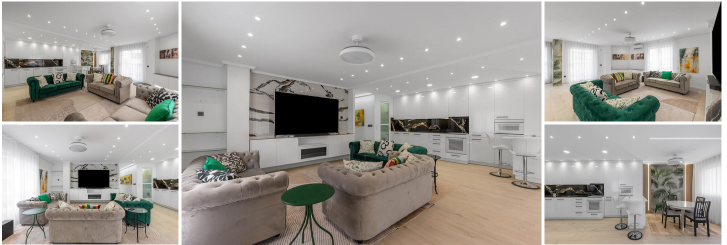
Luxury 3 Bedroom Apartment in the Heart of Los Montesinos

Located in the very center of Los Montesinos, this exceptional first-floor apartment offers a rare combination of luxury, comfort, and convenience, with all amenities within easy walking distance.