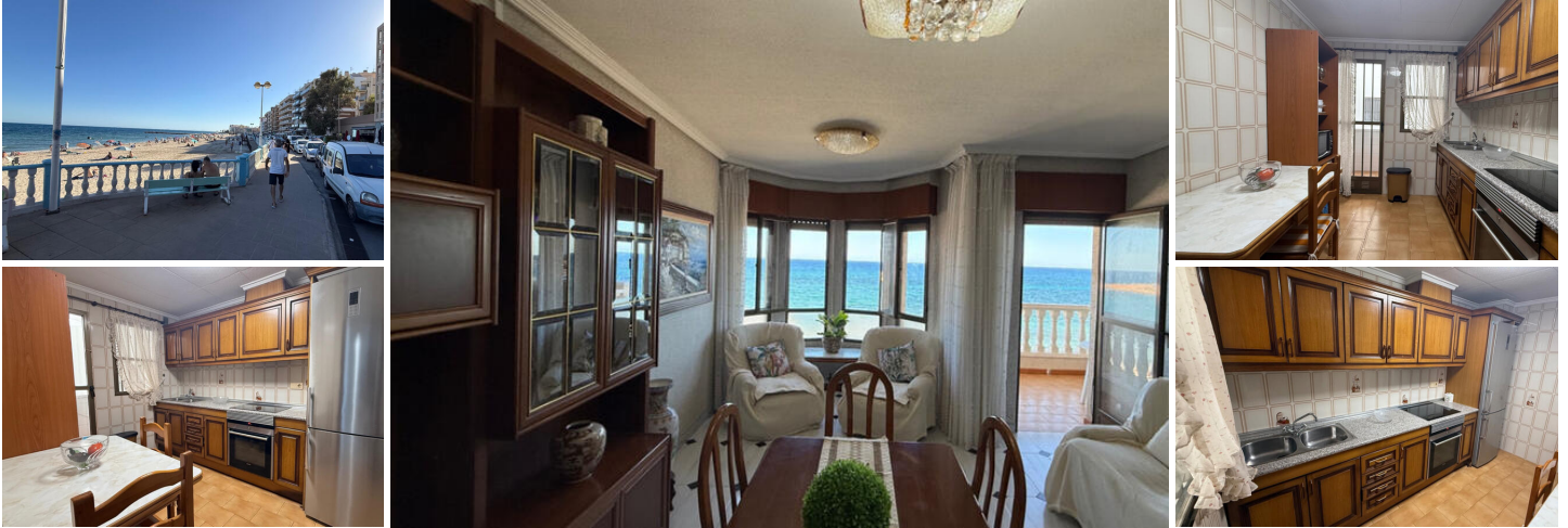
Stunning Frontline Apartment in Playa de los Locos, Torrevieja

Experience Mediterranean living at its finest with this immaculate frontline apartment located directly on Playa de los Locos, one of Torrevieja's most sought-after beaches.