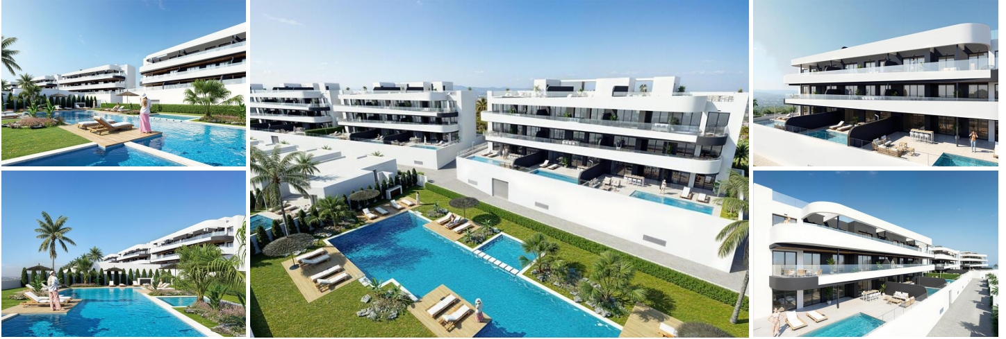
New Build Golf Front Apartments and Villas in La Serena Golf Los Alcazares