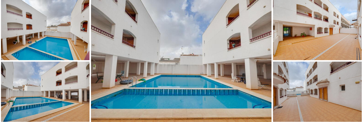
Renovated Apartments in the Center of San Fulgencio