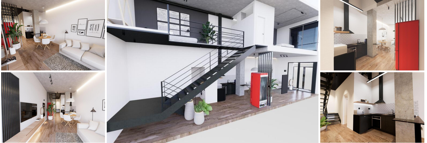
Modern Duplex Loft Apartments in the Heart of Alicante