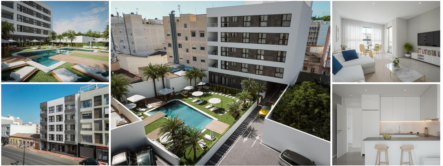
New Development Apartments in Central Guardamar del Segura, Costa Blanca