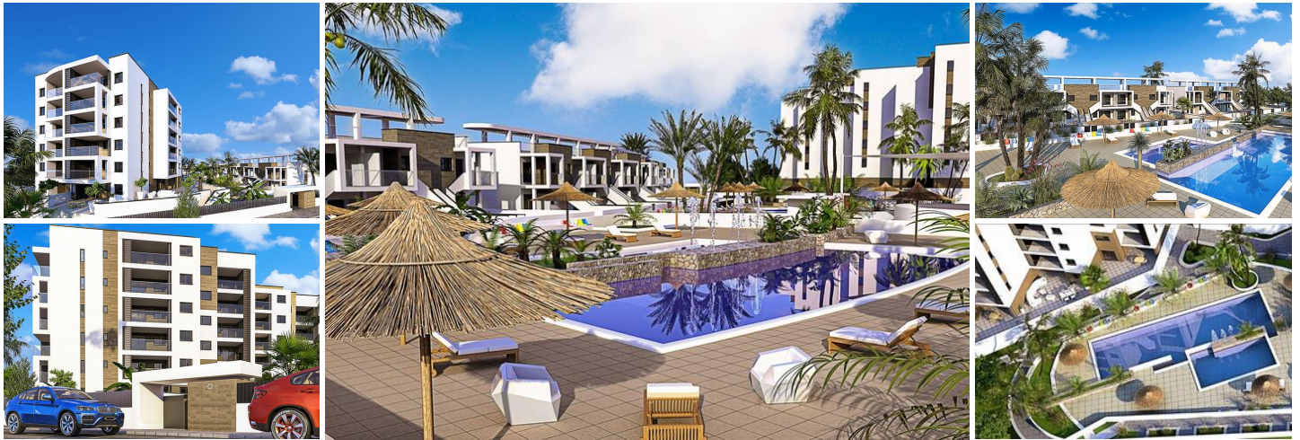
New Build Apartments and Bungalows in Mil Palmeras