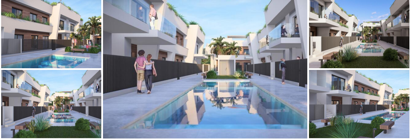
New Construction Homes in Torre-Pacheco, Costa Cálida