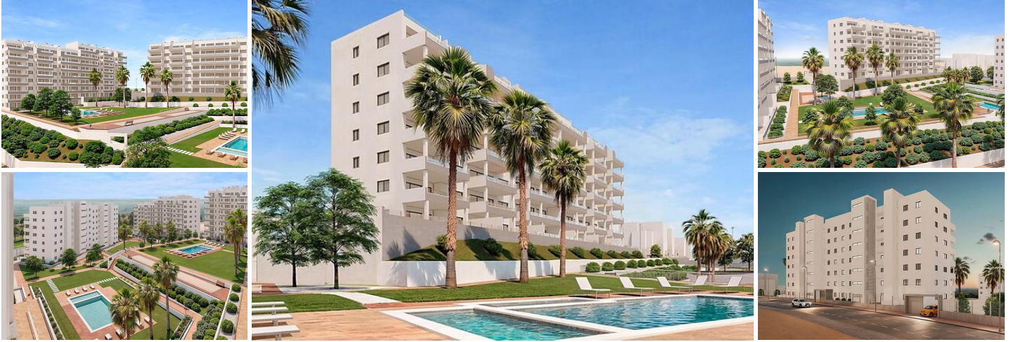
New Residential Development in San Miguel de Salinas