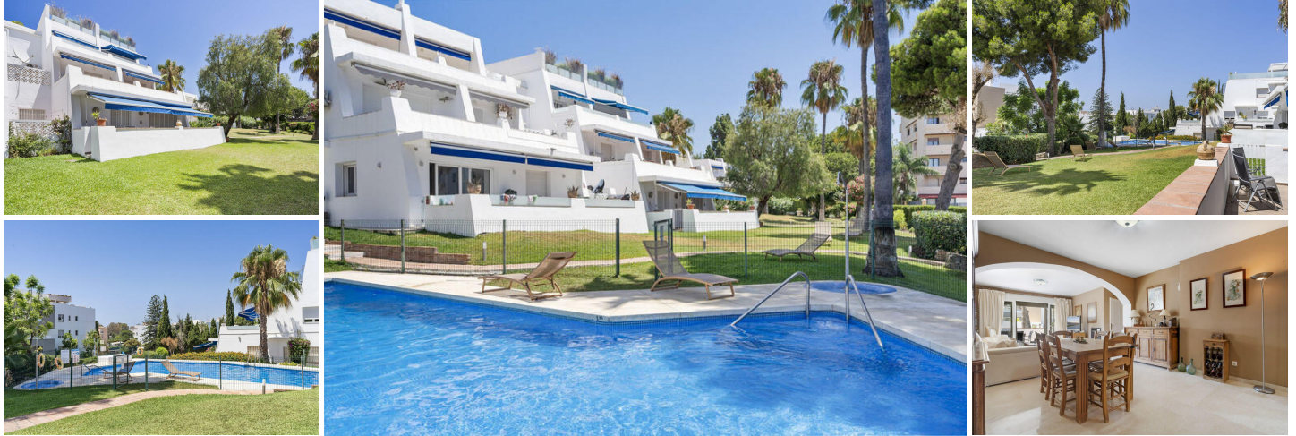
South-Facing Ground Floor Apartment in Prime Nueva Andalucía Location

Ideally located just minutes from Puerto Banús, the Casino, shops, restaurants, and beaches, this bright south-facing ground-floor apartment offers comfort, space, and excellent potential.