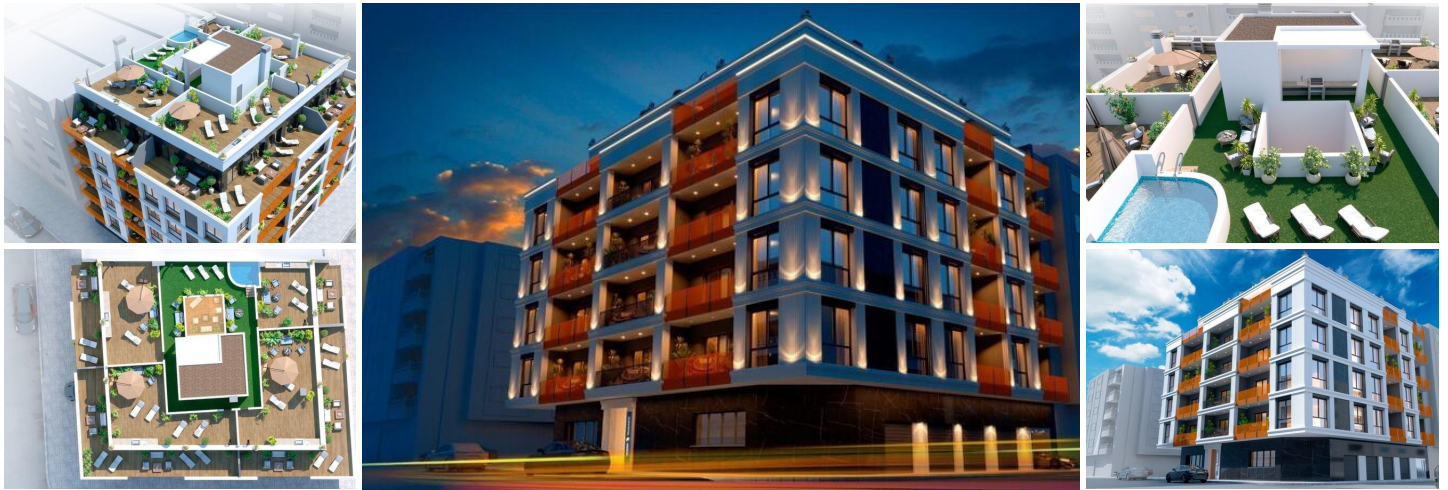
Modern New Build Apartments in Central Torrevieja Costa Blanca