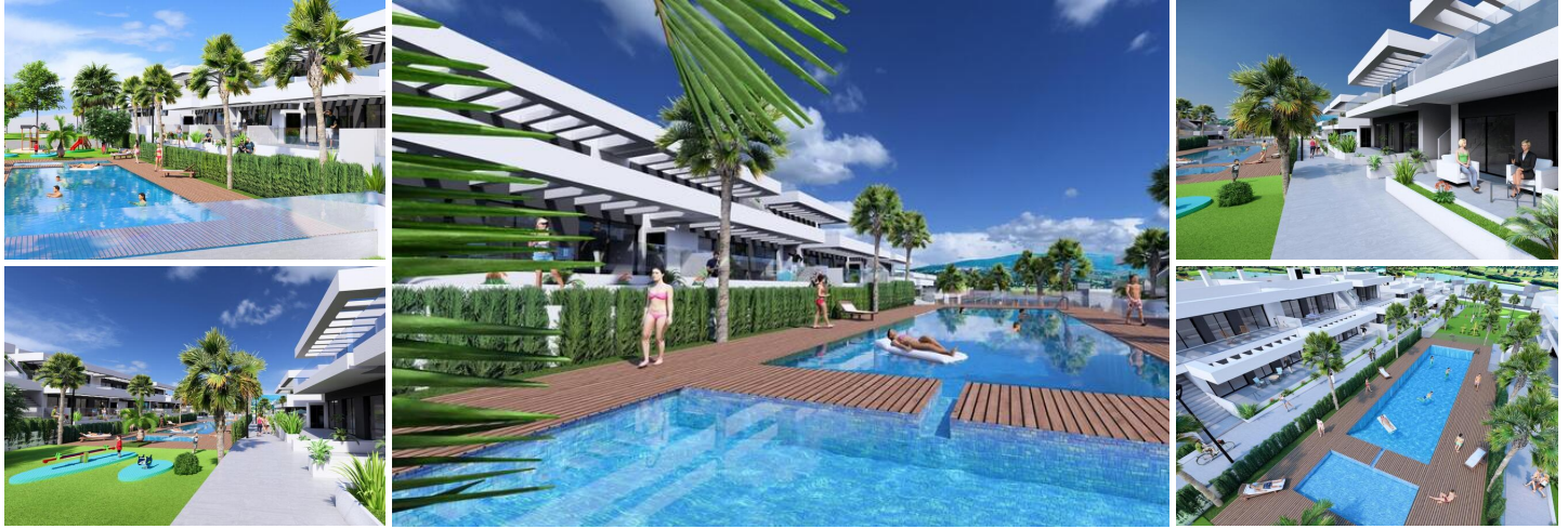
Exclusive New Construction Bungalows in La Finca Golf, Algorfa