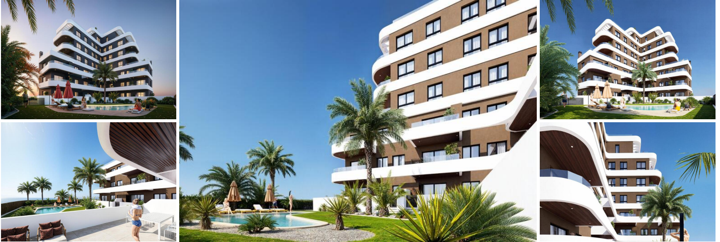
New Build Apartments in Guardamar del Segura – Modern Living Just 1.4 km from the Beach

Discover a new residential development in Guardamar del Segura, Alicante, offering just 19 exclusive, modern homes designed for comfortable, contemporary living on the Costa Blanca. Ideally located just 1.4 km from the beach and a short walk from the town center, this development combines style, practicality, and a prime coastal setting.