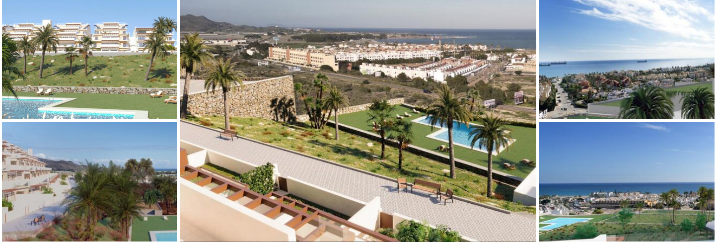
New Build Apartments with Sea Views in Vera Playa, Almería

Discover this exceptional new residential development in Vera Playa, offering 27 modern apartments in its first phase. Designed to combine comfort, functionality, and spectacular Mediterranean views, this project is ideal for those seeking a home on the Costa de Almería with style and convenience.