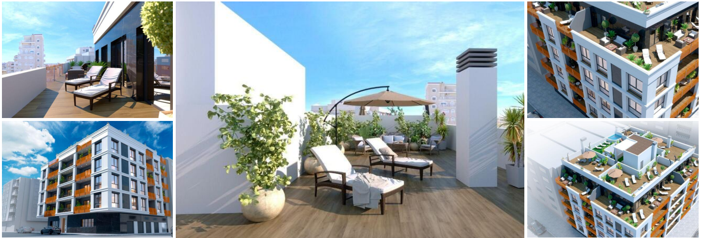
Modern New Build Apartments in Central Torrevieja Costa Blanca