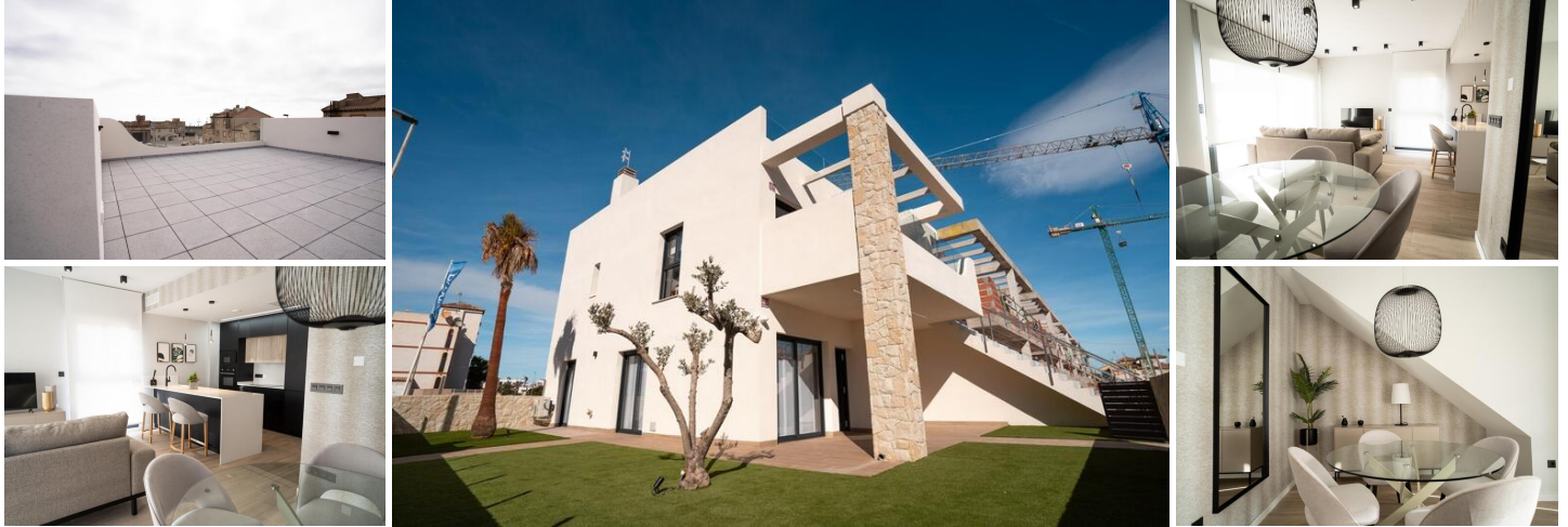
New build bungalows in Pilar de la Horadada