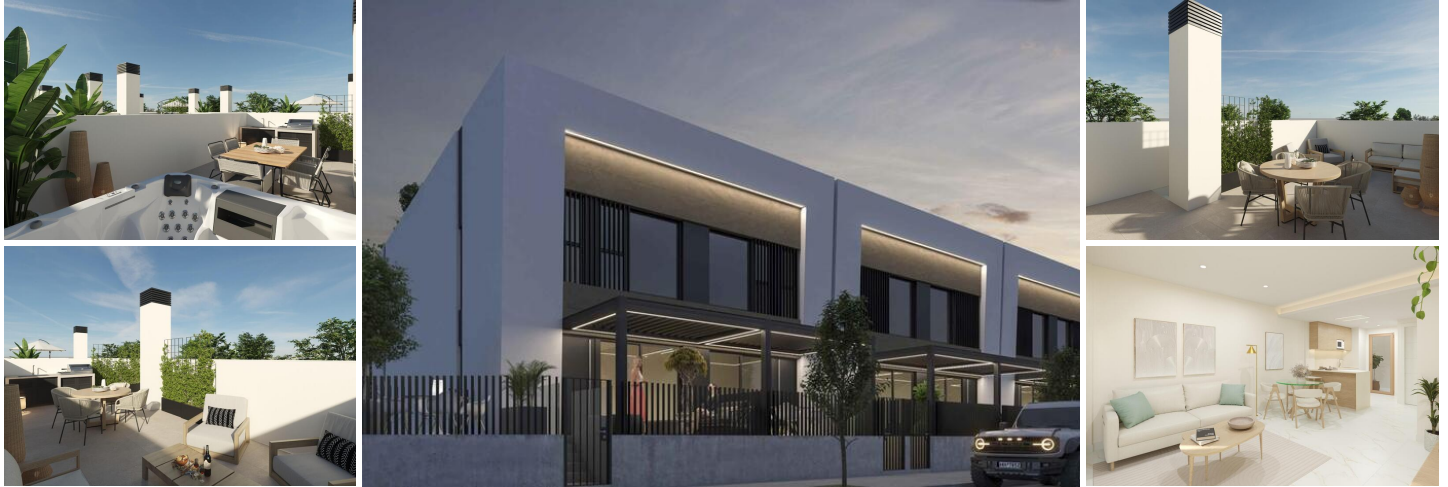
Modern Townhouses in Dolores with comunal pool