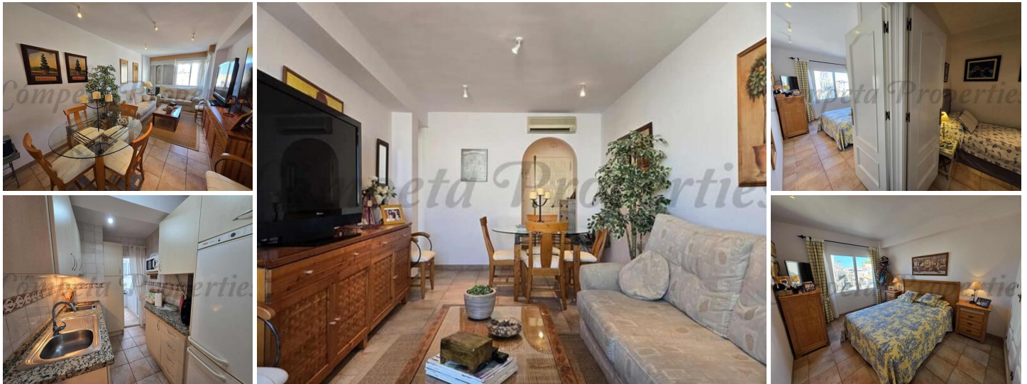
Charming 2-bedroom apartment in Nerja's Parador area

This lovely apartment is located in the heart of Nerja, in the highly sought-after Parador district, just a three-minute walk from the beach and five minutes from the Balcón de Europa. Set within the iconic Edificio Coronado, one of the town's most recognized and desirable buildings, it offers the perfect combination of comfort, convenience, and Mediterranean charm.