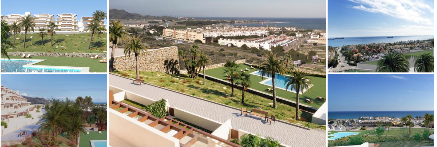
New Build Apartments with Sea Views in Vera Playa, Almería

Discover this exceptional new residential development in Vera Playa, offering 27 modern apartments in its first phase. Designed to combine comfort, functionality, and spectacular Mediterranean views, this project is ideal for those seeking a home on the Costa de Almería with style and convenience.