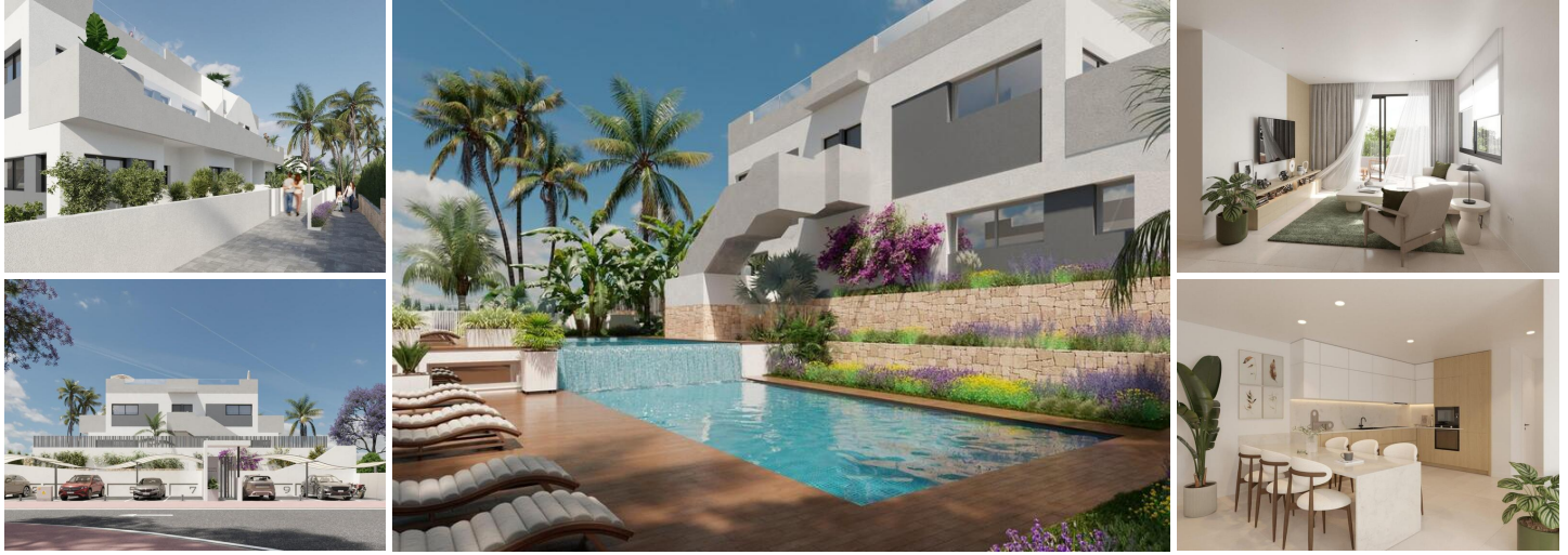
New Build Residential Complex in Los Balcones, Torrevieja