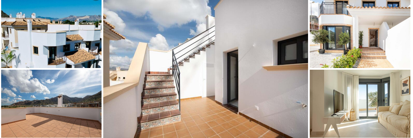
New Bungalows and Townhouses in Cox, Alicante