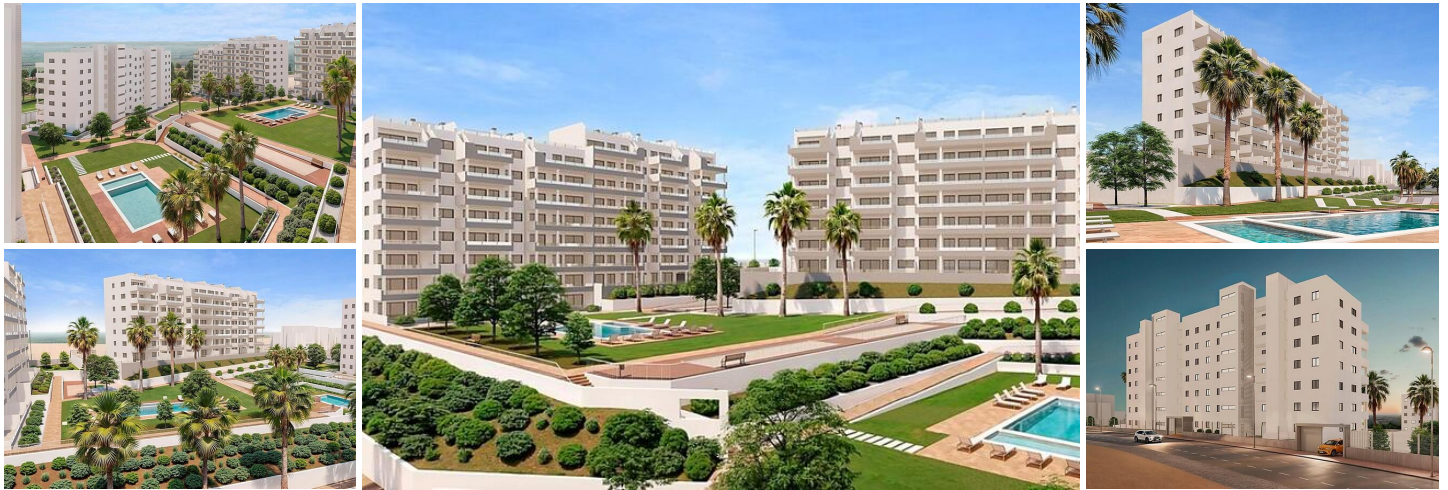
New Residential Development in San Miguel de Salinas