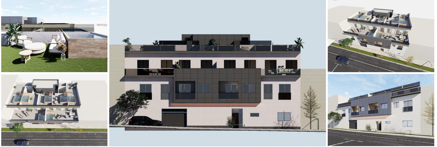
New Build Apartments in Pilar de la Horadada with private Jacuzzi