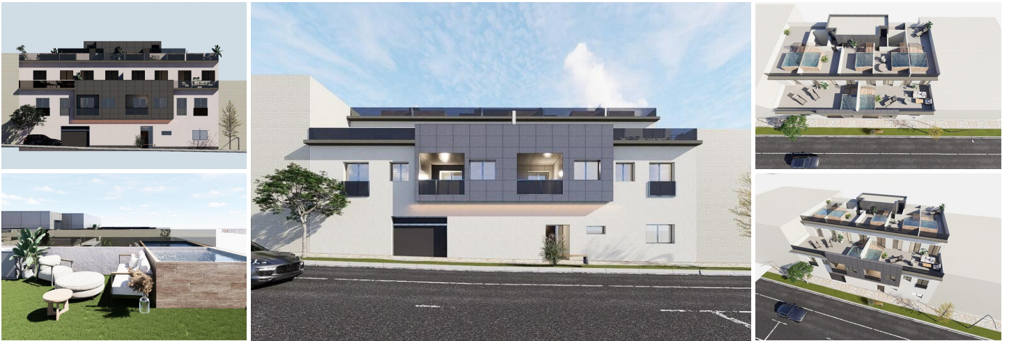
New Build Apartments in Pilar de la Horadada with private Jacuzzi