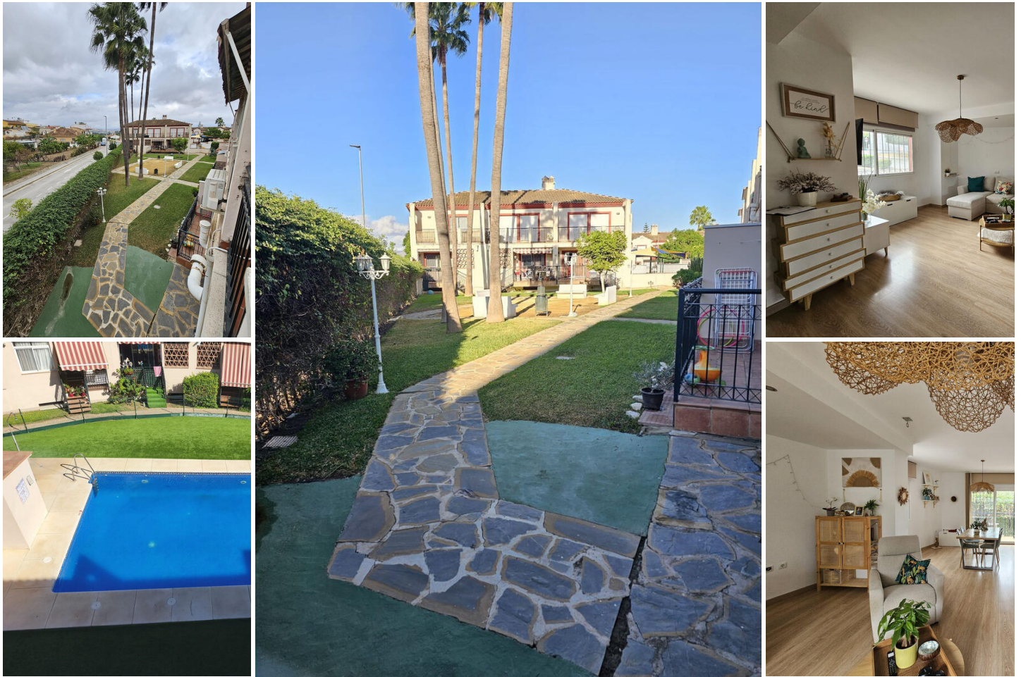
Beautiful Corner Townhouse in El Peñón, Alhaurín de la Torre

This charming three-bedroom, three-bathroom corner townhouse is located in one of the most sought-after areas of Alhaurín de la Torre, in El Peñón de Zapata and El Romeral. The area is known for its tranquility, excellent access to the hyper-ring road, and proximity to shops, schools and services, offering both comfort and convenience for family living.