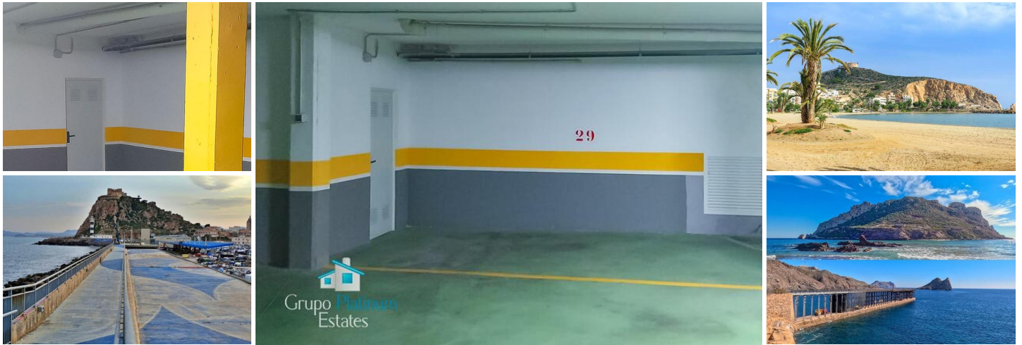
Garage and storage room for sale in Avd. Isla del Fraile, Águilas

The property has a total surface of 39 m 2 , offering more than enough space both to park your vehicle comfortably and to safely store belongings in the adjoining storage room.