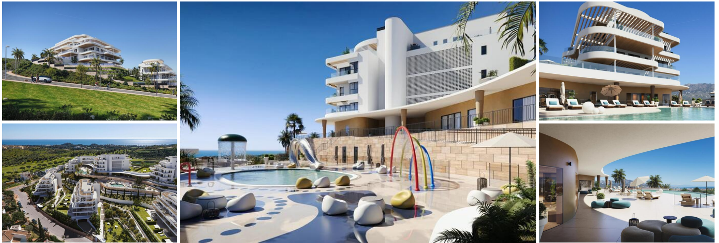
Luxury New Build Apartments in Cerrado del Águila Golf, Mijas with Sea and Golf Views

Experience an exclusive lifestyle in this modern new build resort located in the prestigious Cerrado del Águila Golf area of Mijas. Surrounded by nature and boasting panoramic 360° views of the Mediterranean Sea, mountain view and the golf course, this development offers the perfect combination of elegance, comfort, and convenience on the Costa del Sol.