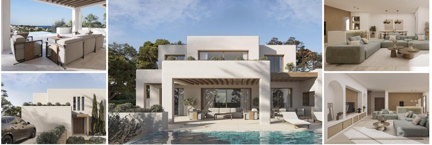
Sea view villa with Ibiza charm in La Fustera, Benissa

This stunning newly built villa combines the elegance of contemporary architecture with the warmth and character of Ibiza design. Located in the sought-after area of La Fustera (Benissa Costa), it enjoys panoramic sea views and is just minutes from the beach, supermarkets, restaurants and other essential services.