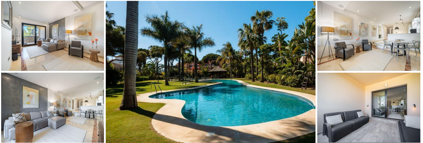
Luxury 3-Bed Apartment with Spacious Terrace in a Prime Beachside Location in Puerto Banús

This freshly renovated 3-bedroom apartment sits on the middle floor of a sought-after beachfront complex, just a short stroll from Puerto Banús. Designed with modern living in mind, it features open-plan spaces, a sleek kitchen, and stylish updated bathrooms – all finished to a high standard for a relaxed, contemporary feel just moments from the sea. Sold with the benefit of a large underground parking space and a storage room.