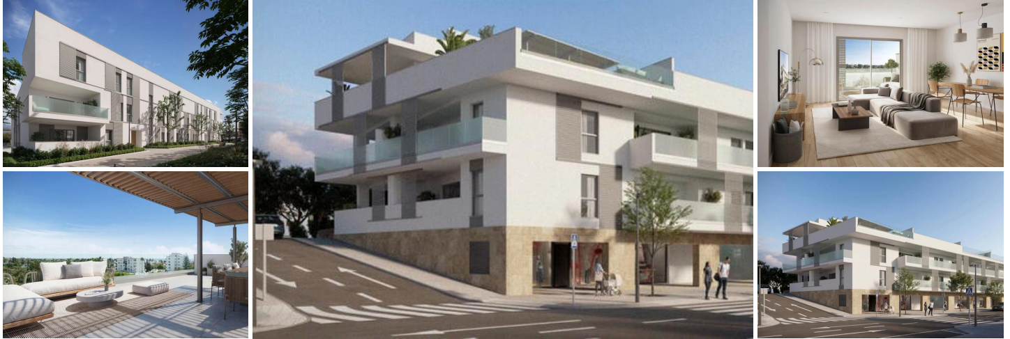
New Luxury Homes in San Pedro Alcántara, Málaga

Discover an exclusive residential development in San Pedro Alcántara, designed to offer maximum comfort and elegance in a privileged setting. This residential complex features 19 one-, two-, and three-bedroom homes, all designed with high-quality materials and spacious terraces offering stunning views of the sea and the Marbella mountains.