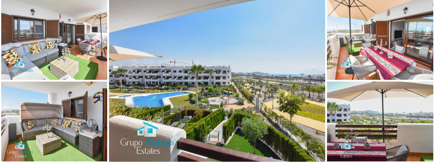
Stylish FirstFloor 3 Bedroom Apartment with Sea Views in Phase 7 of Mar de Pulpí

Experience Mediterranean living at its finest with this beautifully furnished and fully equipped first floor apartment, ideally located in the sought after Phase 7 of Mar de Pulpí, San Juan de los Terreros. Spanning 97 m 2 , this 3 bedroom, 2 bathroom residence offers the perfect blend of comfort, quality, and unbeatable sea views, all just a short stroll from the beach and local amenities. Step inside and be welcomed by a spacious, light filled living and dining area that opens directly onto a raised terrace. From here, you can take in sweeping views over the bay of San Juan de los Terreros a truly unique setting. The open plan kitchen is designed in a practical Lshape and has been thoughtfully upgraded with high spec appliances, an integrated wine bar, black marble finishes, and lacquered white furniture. A separate utility room houses the washing machine and provides additional storage.