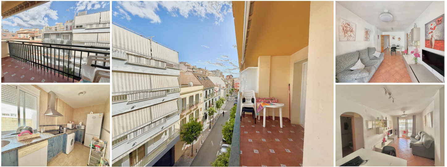
Apartment in Second Line of Beach in the Center of Fuengirola

Located in one of the best areas of Fuengirola, this fantastic apartment is just steps away from the beach, in the second line, and right in the heart of the city, offering an unbeatable location. It is an ideal property for those seeking to enjoy seaside living with all the amenities of the city.